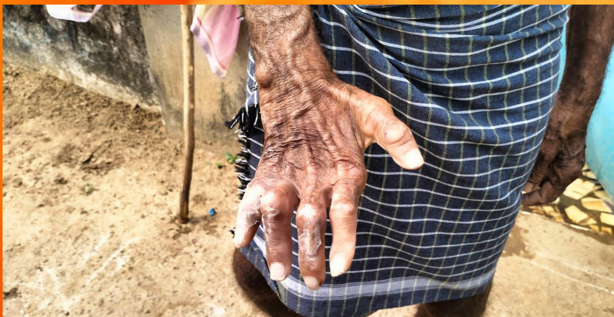
Connecting the suspected cases to the Doctor