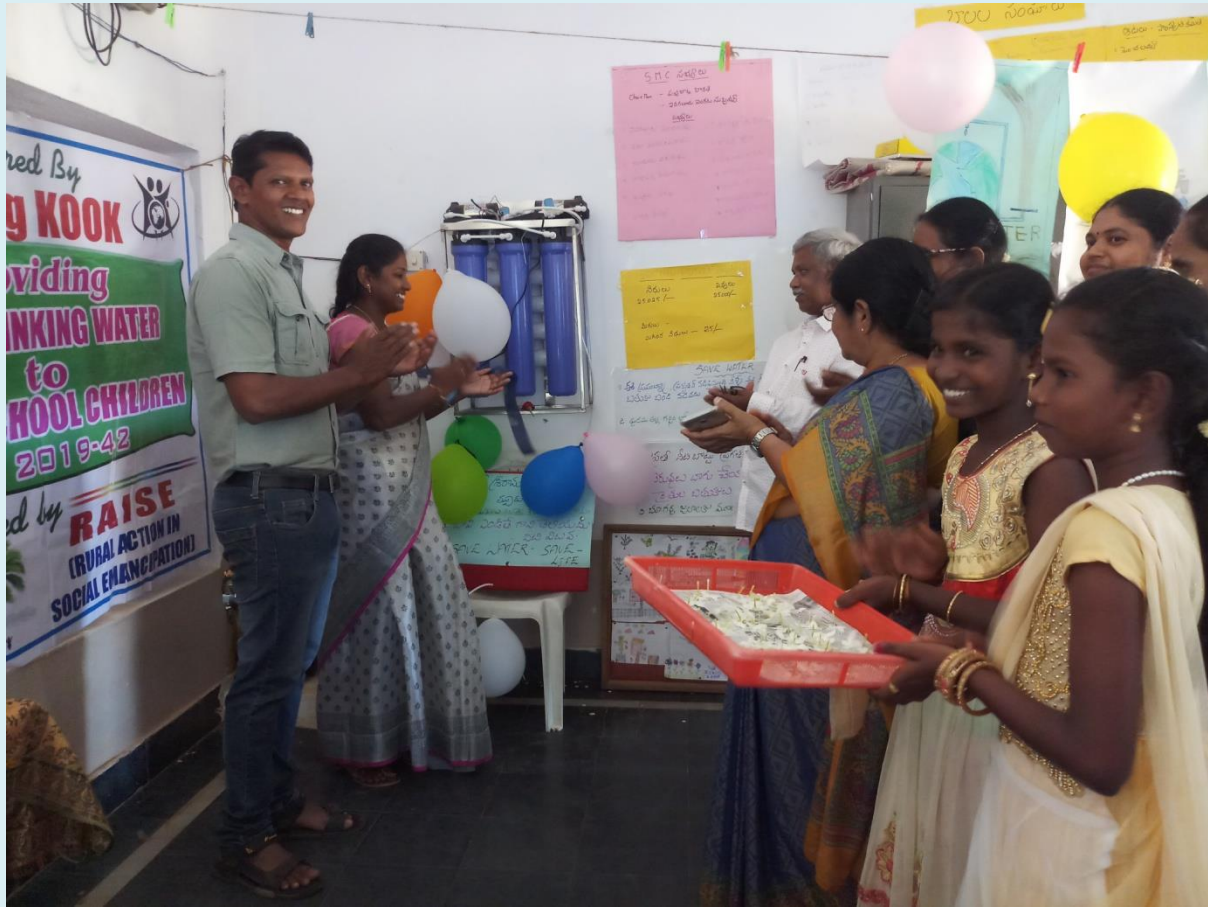
b) Children are happy to have pure drinking water