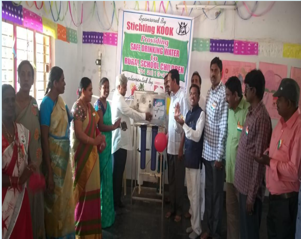
b)program held at school during installation