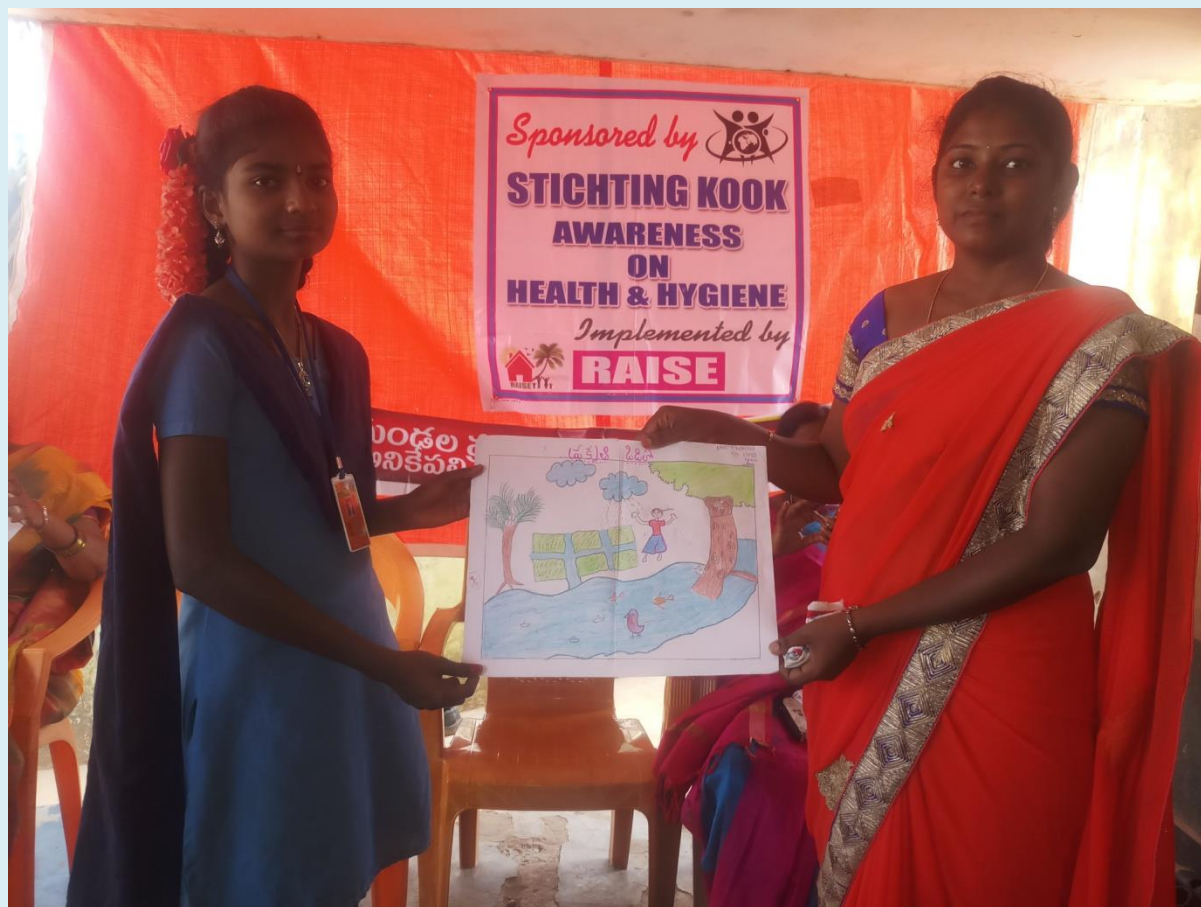
e)Village youth training program