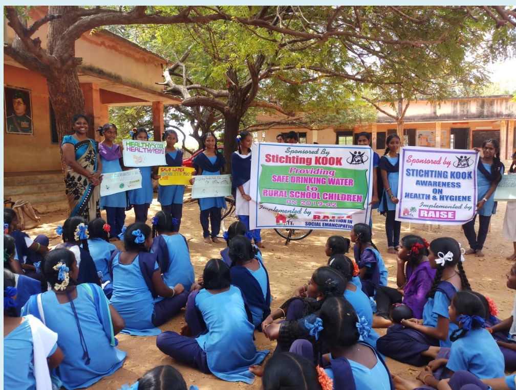
C) Youth training program