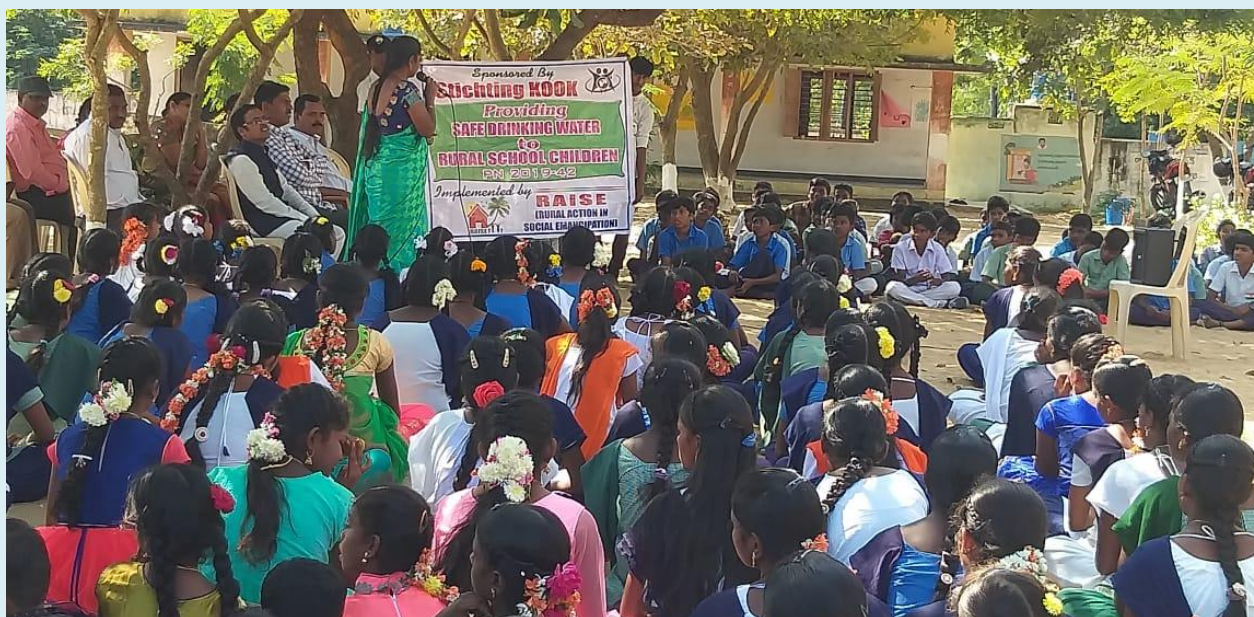
e)Awareness program on health and hygiene