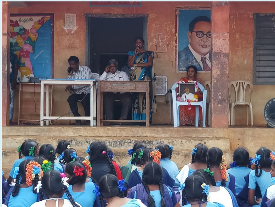
b) Conducting of Awareness program