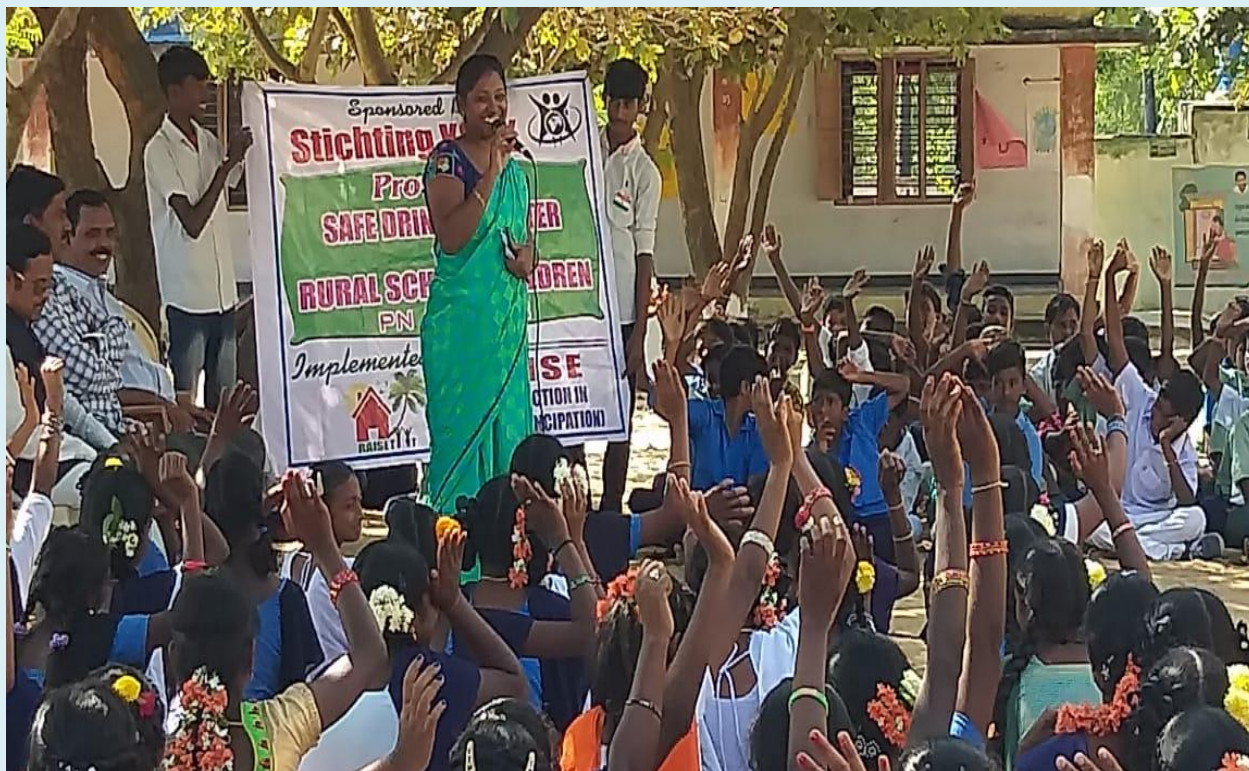
d)Explaining regarding Stichting KOOK