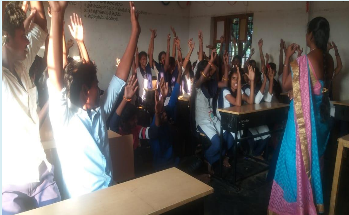
e)Youth training program