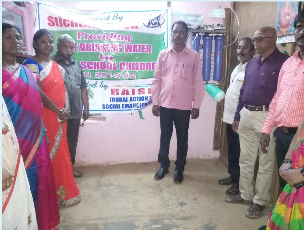
c)Children are happy to have safe drinking water