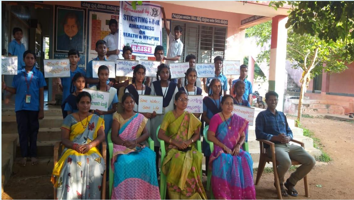
d)Interacting with the students