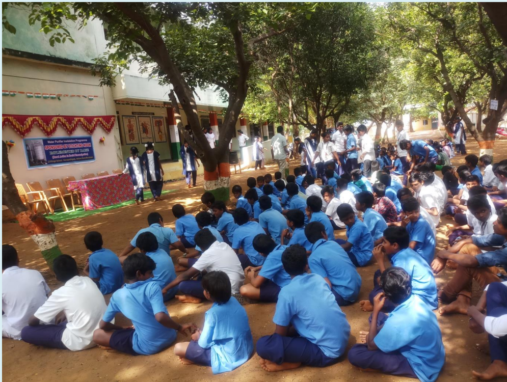
c)Awareness on health and Hygiene