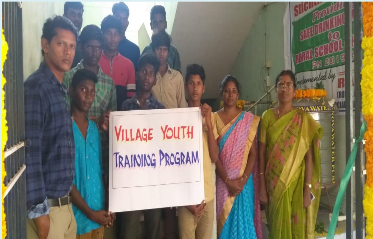
f)Children development committee