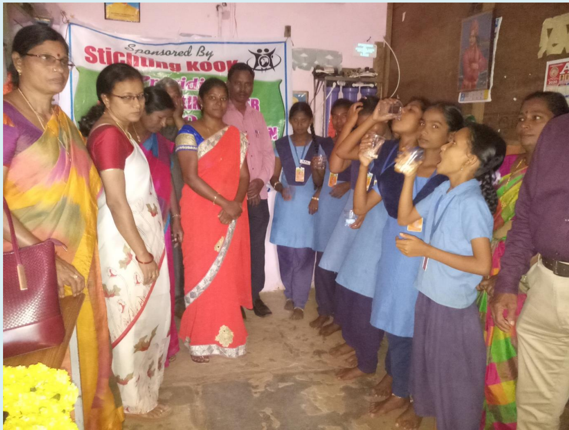
d) Awareness program on health and hygiene